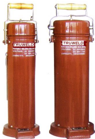
EOB-5-RM / EOB-10-RM – MILD STEEL EOB-5-RS / EOB-10-RS – Stainless Steel