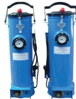
EO-TC-5T & EO-TC-10T Temperature Control / Gauge