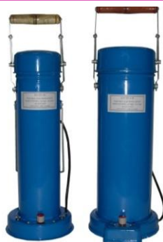
EO-TC-5B & EO-TC-10B - TEMP CONTROLLED