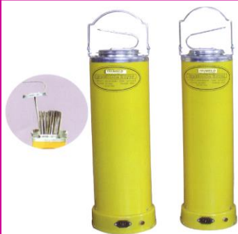
EOC-5-RM & EOC-10-RM