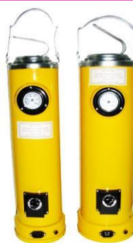
EO-TC-5C & EO-TC-10C -TEMP CONTROL & GAUGE