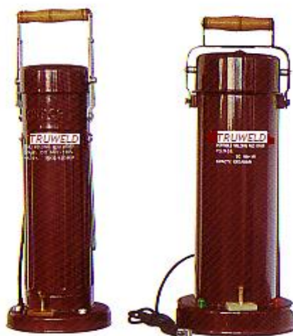
EOB-5-RM-MT & EOB-10-RM-MT MAGNET TYPE – MILD STEEL